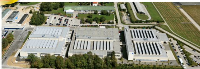
Plant Memmingerberg Development | Production