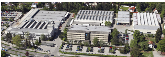
Memmingen Main Plant Sales | Development | Production